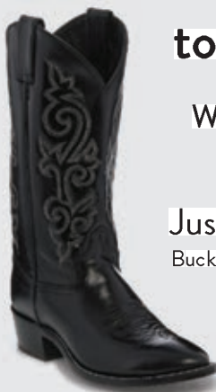
Justin® Buck Black