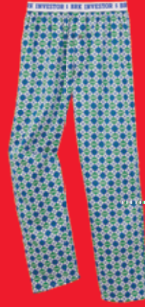
BERKY LOUNGE PANT™