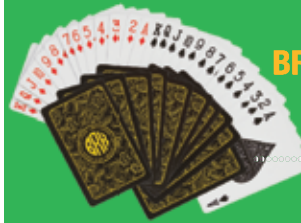
BERKSHIRE BRIDGE CLUB PLAYING CARDS