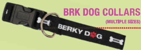
BRK DOG COLLARS (MULTIPLE SIZES)