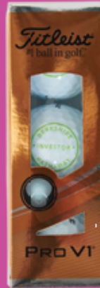
CUSTOM BRK INVESTOR GOLF BALLS