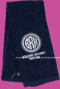
PREMIUM BRK VELOUR GOLF TOWEL